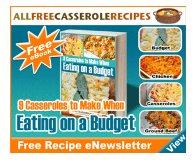
9 Casseroles to Make When Eating on a Budget